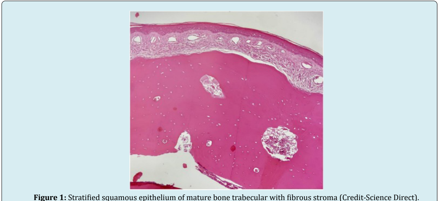
Figure 1: Stratified squamous epithelium of mature bone trabecular with fibrous stroma.

Haversian -like canals, which was surrounded by a thin fibrous capsule covered by stratified squamous epithelium are the features of osteoma on histological examination [4] (Figure 1&2).